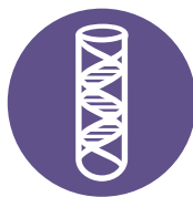
CDx & IVD